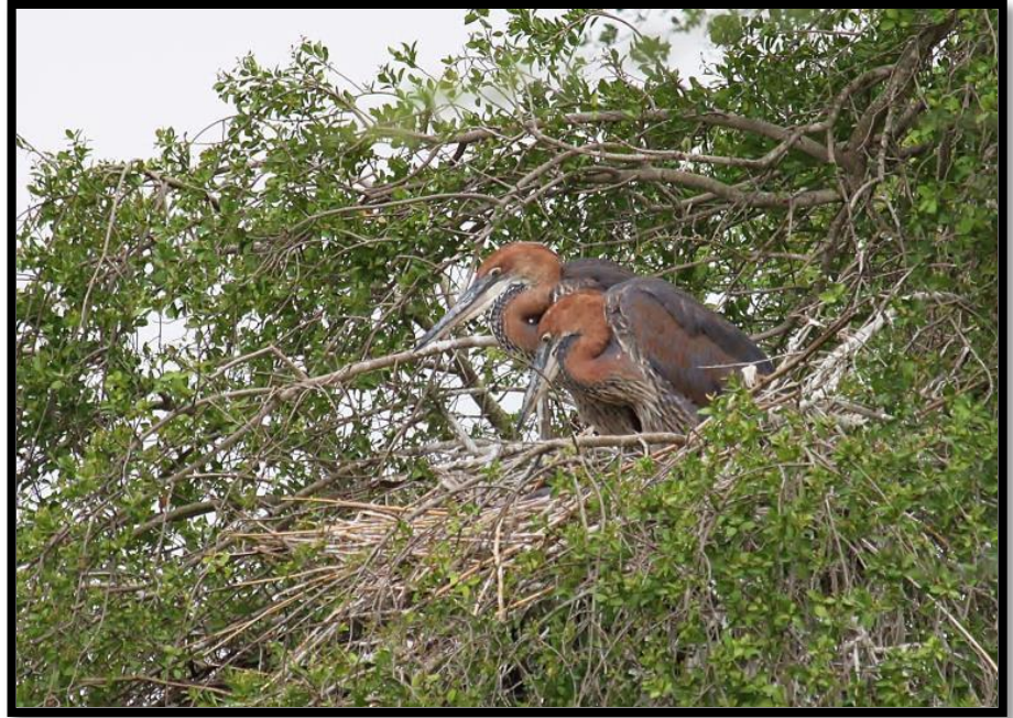
Goliath Heron Juveniles

Spoonbill, Spur-winged Goose, Red-billed and Hottentot Teals, Black-winged Stilt, the beautiful Long-toed Plover, Spur-winged Plover, Little Stint, Ruff, Common Greenshank, Whiskered and White-winged Terns, and Brown-throated Sand (or Plain) Martin. Other good birds include Chestnut Sparrow, Yellow-spotted Petronia, Black Bishop, Vitelline Masked Weaver, Crested Guinea fowl, Crimson-rumped Waxbill, Cardinal Quelea and colorful Red-and-Yellow and Usambiro